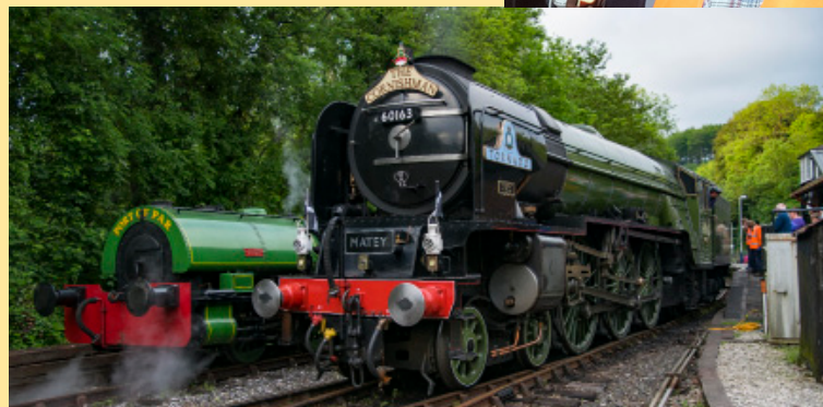
In June 2017 A1 60163 "Tornado" made its first visit to Cornwall and the Bodmin and Wenford Railway. Our most successful special event only made possible by our Volunteers active support and involvement.

All information correct at time of printing, June 2018. All images belong to members of the Bodmin Railway Preservation Society.